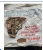
Nick Otter/Front (=clay)